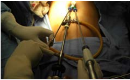
All instruments through one incision in the navel

Currently, the following operations can be performed by SILS -