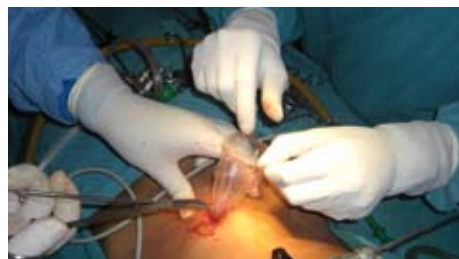
Delivery of appendix from navel incision