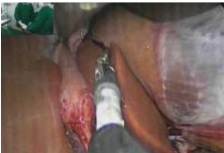
Gall bladder dissection