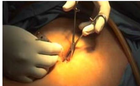
Incision in navel