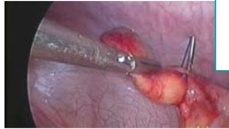
Traction to appendix