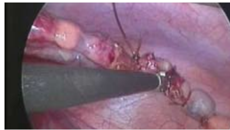
Appendix being cut