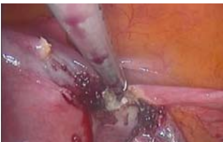
Dissection of uterine ligament